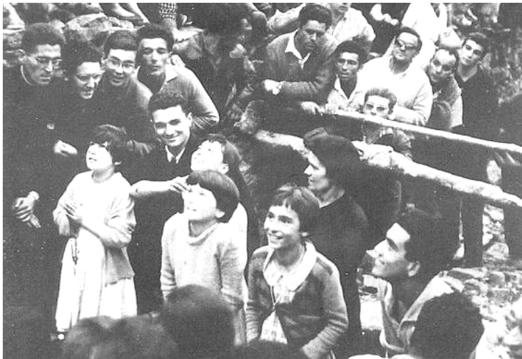
Garabandal: The four girls with Mary in 1961.

On 18 August 1961 Mary began to teach the girls how to pray the rosary: "The most important and timely part of the message of Garabandal – a thing not immediately apparent – is its insistence on prayer and on prayer well said. There is stress on both of these things, prayers and proper praying. Our Lady came some 2000 times at Garabandal and each time from August 1961 she told the girls to say the rosary. She made them recite the rosary during the various