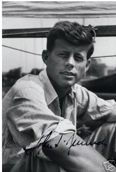
A young JFK

There is much evidence available to show the influences and interests at work in John F. Kennedy's early life in the years before he became President which helped prepare him to cope with and understand the almost unimaginable pressures of the missile crisis when it came in October 1962. As far back as his student