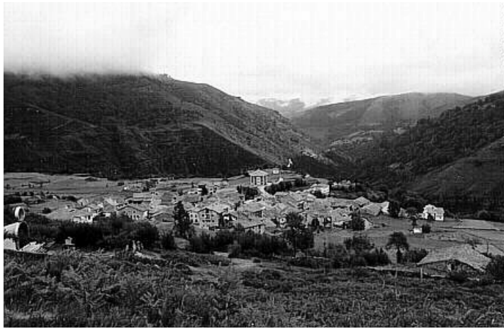
The village of Garabandal in Northern Spain

missiles into Cuba and nuclear war threatened - was indeed not attributable to the wisdom of the world's leaders. As Robert MacNamara and others in the Kennedy administration have said repeatedly, 'we lucked out'. At the same time we suggest that